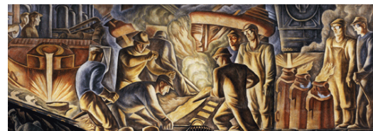
Exhibit at State Museum: A Common Canvas

Elizabethtown College is near several places you might visit, like Hershey, Lancaster County, and Harrisburg