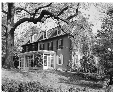
Charles Willson Peale's Belfield

If that was not enough, Peale founded the nation's first natural history museum. Because of Peale's museum, Americans could see, many for the first time, a wide variety of birds, mammals, lizards, fish and more; stuffed and mounted and displayed in replicas of their natural habi-