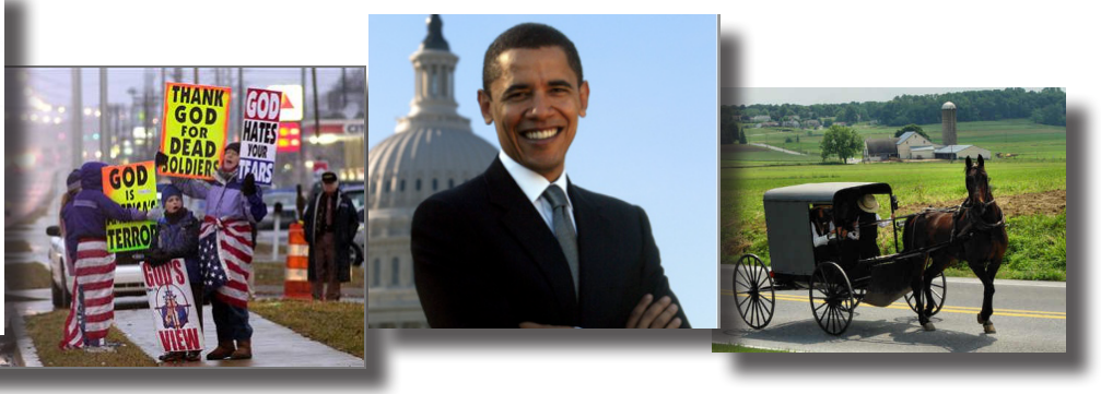
The Spring 2009 MAASA-PPSA Conference Faith, Politics, Culture: American Mixtures

The Middle Atlantic American Studies Association (MAASA) is a regional chapter of the American Studies Association organized to promote and encourage the study of American Culture in the Delaware, New Jersey, New York, and Pennsylvania areas. The MAASA sponsors an annual conference, special lectures and events, and publishes the newsletter twice a year.